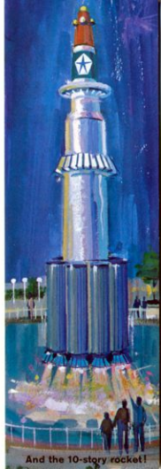
And the 10-story rocket!