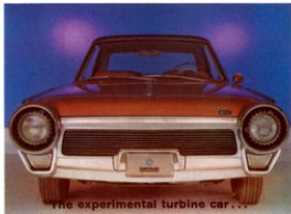
The experimental turbine car . . .

turbine car rides around Imagination Island. See it in action! In the lagoon just outside Imagination Island are a 10-story rocket, (symbolizing Chrysler's role in America's space and missile effort) and "floating" displays of cars manufactured by Chrysler Corporation.