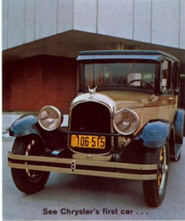
See Chrysler's first car . . .