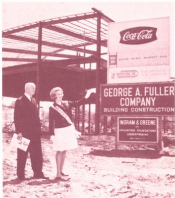
America's Junior Miss Diane Sawyer and James A. Farley, chairman of the board of The Coca-Cola Export Corporation, look over the site of the Coca-Cola Exhibit at the Fair.