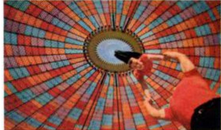
Gymnasts perform at New York State Pavilion