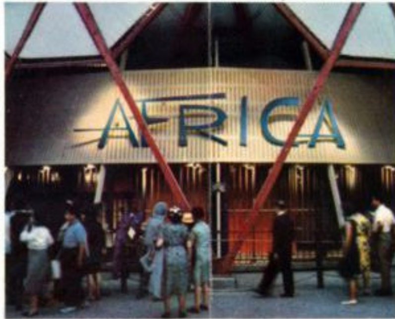
The exotic African Pavilion