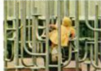
Danish Pavilion playground