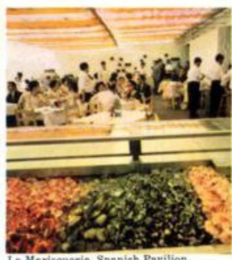
La Mariqueria, Spanish Pavilion