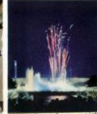
Free fireworks every night

When you're making plans to come to the once-in-a-lifetime New York World's Fair, questions about money and food and fun for the kids are bound to come up. Here are some facts that will set your mind—and your budget—at ease!