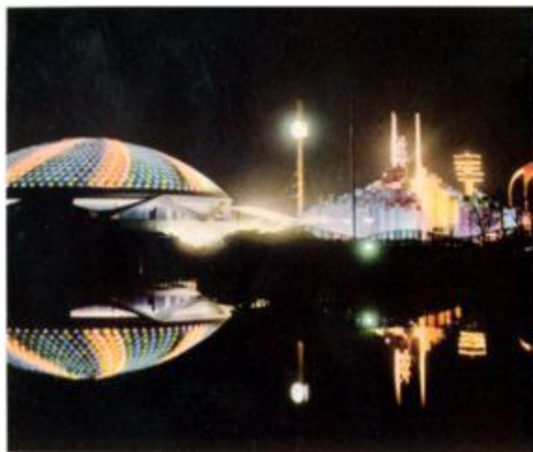
The Fair sparkles at night