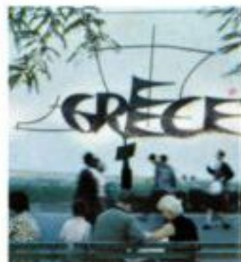
Pavilion of Greece