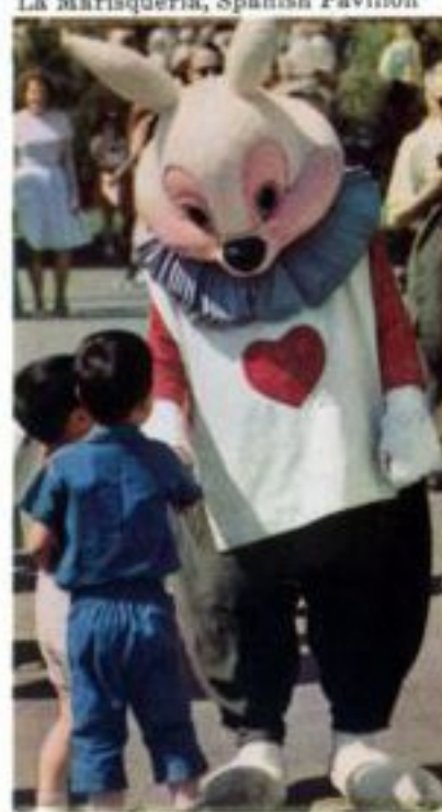
At the Pepsi-Cola Pavilion

There's more entertainment in store for you at the Fair than you can imagine. You'll enjoy rides, thrills, shows, music, fireworks, fountains, spectacles, parades, bands, celebrities, a zoo, a magic show, dancing, singing . . . you name it! So come to the Fair . . . for the Fun of it!