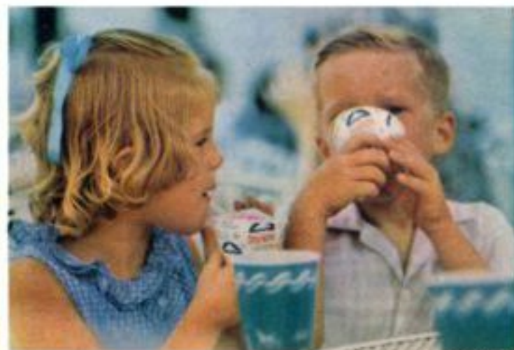
Ice at a snack bar