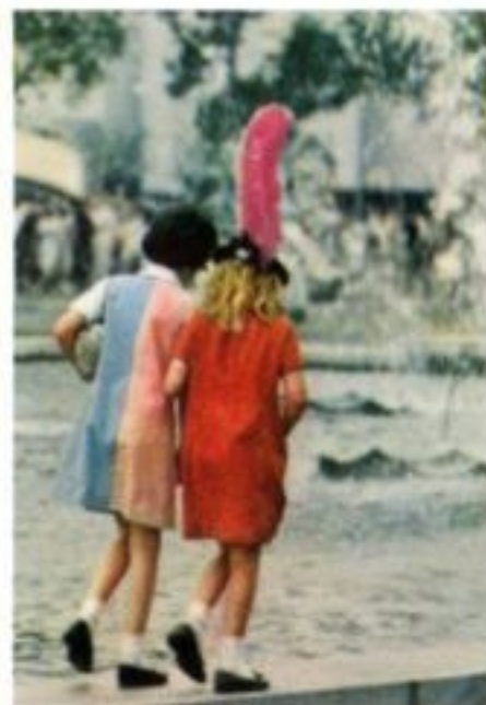
One of many fountains