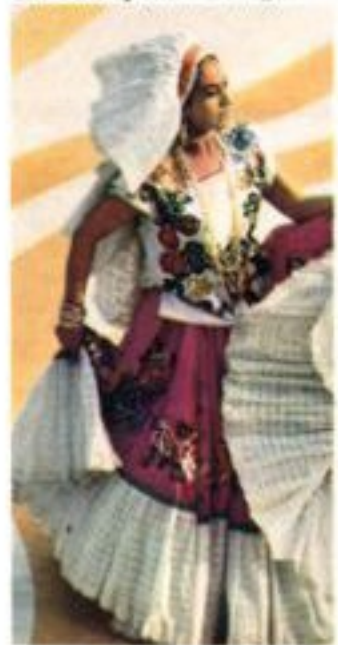
Mexican folk dancer