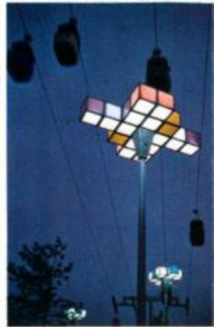
Sky riding at night