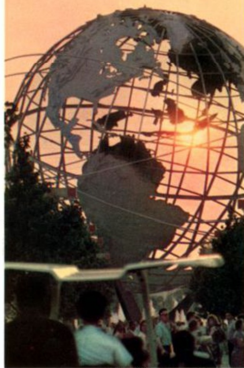
Images presented by World States Booth