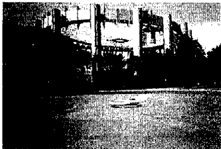
© Bruce Mentone / Existing Conditions

Indoor and Outdoor Cafes Landscaping and Gardens